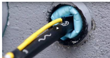
Installation cable duct seal Ø ≤ 60 mm